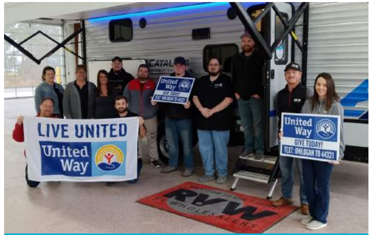
RV Wholesalers in Lakeview donated a new Catlina Camper, which served as the lead gift for our Online Auction in December.

198 local businesses and 2,597 individuals gave to United Way of Logan County this year. THANK YOU to all who extend the giving opportunity to your employees via payroll deduction through a traditional workplace campaign. You accounted for 70 percent of our campaign revenue this year. Others made one-time gifts. Still others sponsored United Way events or donated in-kind product or service donations. We can't do our work without all of you!