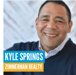
KYLE SPRINGS ZIMMERMAN REALTY