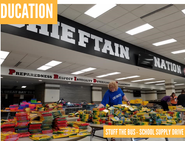
STUFF THE BUS - SCHOOL SUPPLY DRIVE

United Way dollars are invested in youth programming to ensure that our kids have opportunities to learn and be healthy throughout their developmental years to prepare them for successful careers.