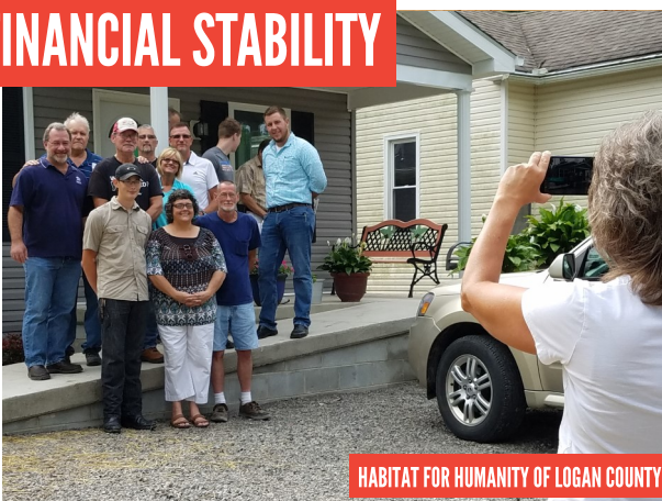
HABITAT FOR HUMANITY OF LOGAN COUNTY

38% of Logan County households struggle to make ends meet. Our programs help working families stretch their budgets and connect them with resources to maintain housing and work situations.