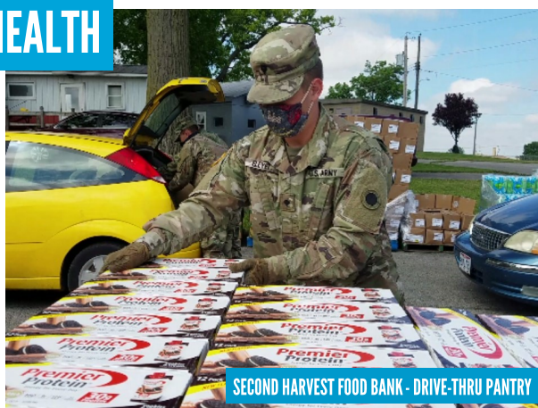
SECOND HARVEST FOOD BANK - DRIVE-THRU PANTRY

Among the enduring images of 2020 will be the Ohio National Guard assisting with long food distribution lines the likes of which we haven't seen since the Great Depression. Second Harvest Food Bank regularly doubled or tripled clients.