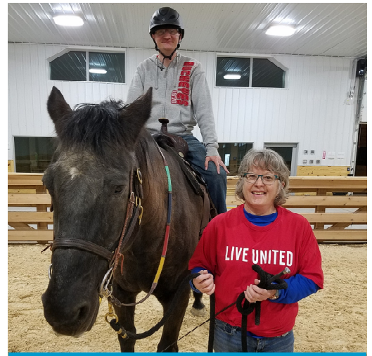
YOUR UNITED WAY GIFT PROVIDES SCHOLARSHIPS SO SPECIAL NEEDS CONSUMERS CAN SADDLE UP AT DISCOVERY RIDERS THERAPEUTIC RIDING CENTER AND LEARN SOCIAL SKILLS THAT TRANSFER TO HOME AND SCHOOL.