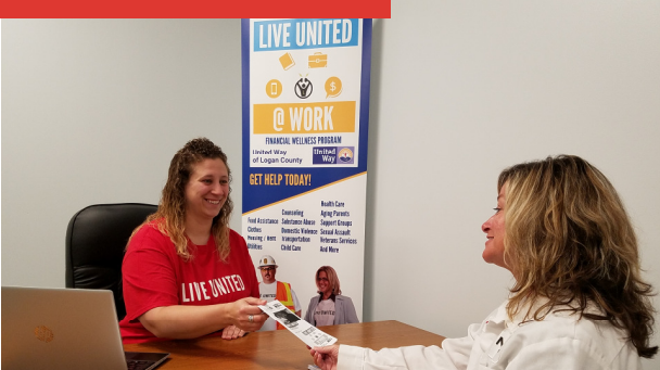
LIVE UNITED @ WORK FINANCIAL WELLNESS PROGRAM

38% of Logan County households struggle to make ends meet. We are the second United Way in Ohio to provide on-site resource coordination to employees of participating workplaces, connect working families with help they need.