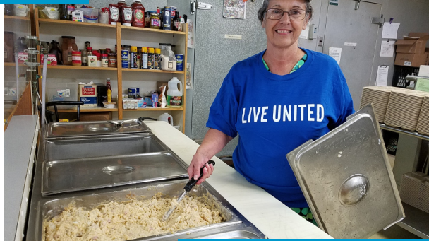
LUTHERAN COMMUNITY SERVICES - OUR DAILY BREAD

No one should ever go hungry in Logan County. Over half a million meals were provided last year through our Funded Partners. Rides to doctor visits, prescription medication, and access to exercise are also available.