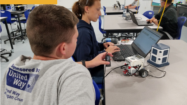
COMMUNITY IMPACT FUND - OHIO HI-POINT CAREER CENTER

More United Way dollars are invested in youth programming than any other area to ensure that our kids have opportunities to learn and be healthy throughout their developmental years to prepare them for successful careers.