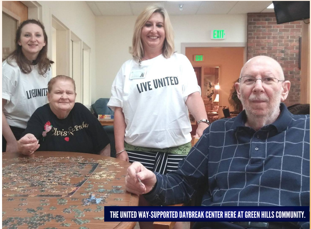
THE UNITED WAY-SUPPORTED DAYBREAK CENTER HERE AT GREEN HILLS COMMUNITY.